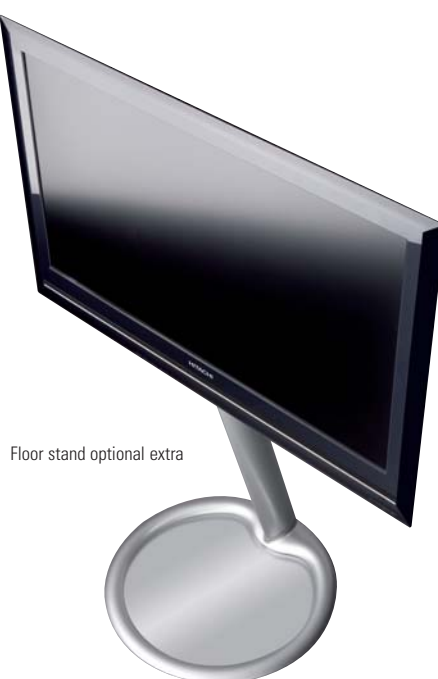
Floor stand optional extra

The UT42MX70 has been re-engineered from the inside out using pioneering techniques to produce a super-slim flatscreen with a profile of just 35mm excluding bezel – a third of the depth of conventional LCDs. This radical design enables users to position the screens wherever and however they like without compromising the viewing performance.